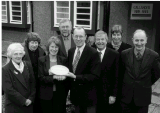
Callander Kirk with its Eco-Congregation award